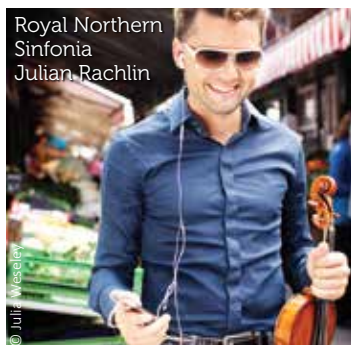
Royal Northern Sinfonia Julian Rachlin