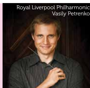
Royal Liverpool Philharmonic Vasily Petrenko

BEETHOVEN: Ah! Perfido, op. 65 HAYDN: Cello Concerto in C MAHLER: Symphony No. 4